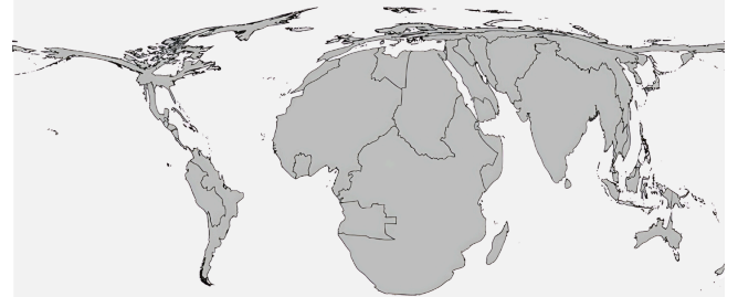
World map adjusted to reflect magnitude and severity of climate-related mortality by country.